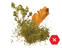
No Yard Waste