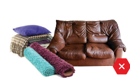
No Clothing, Furniture or Carpet