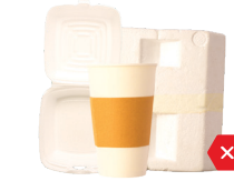
No Foam Cups & Containers