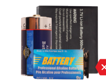
No Hazardous Waste or Batteries