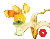
No Food or Liquids