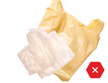
No Loose Plastic Bags, Recyclables in Plastic Bags, or Film Empty recyclables directly into your cart